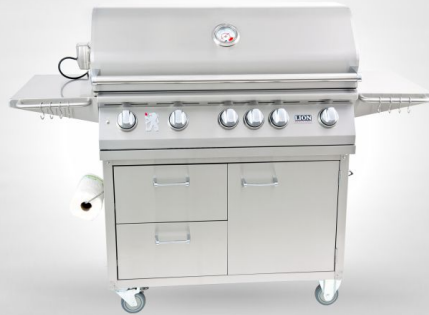
L-90000 CART - L963872 -