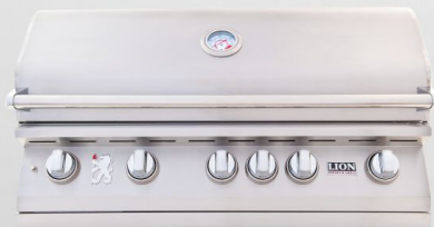
L90000 — 40"