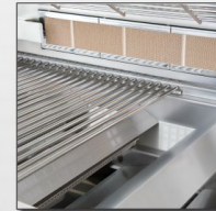
CAST STAINLESS STEEL BURNER