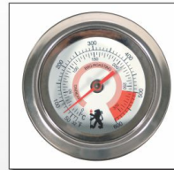
COMMERCIAL TEMPERATURE GAUGE