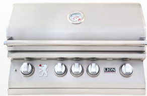
L75000 — 32"