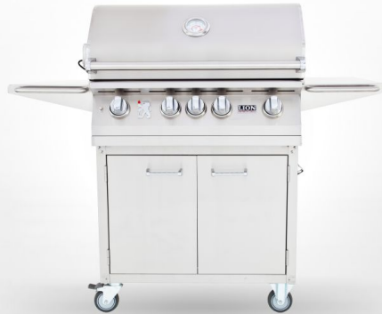
L-75000 CART - 53621 -