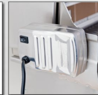
ROTISSERIE & BACK BURNER HEAVY DUTY GEAR ACTION MOTOR