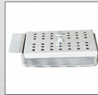
STAINLESS STEEL SMOKER BOX