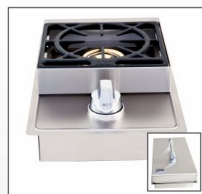
SINGLE SIDE BURNER - LP L6247 NGL5631 -