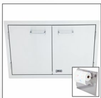
DOUBLE DOOR W/ TOWEL RACK - L3322 -