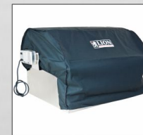
L75000 BUILT-IN CANVAS COVER - 41738 -