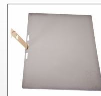
LION PREMIUM GRIDDLE - 62734 -