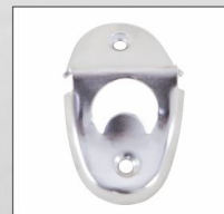
BOTTLE OPENER - 48163 -