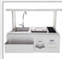
30" BAR CENTER - 19836 -