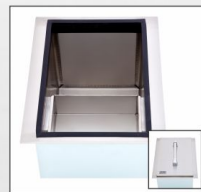
ICE CHEST - L5312 -