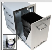
MULTI FUNCTIONAL BIN - L55628 -