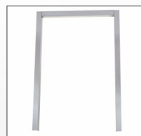
REFRIGERATOR FRAME - 32923 -