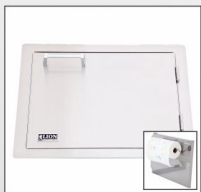
HORIZONTAL DOOR W/ TOWEL RACK - L2219 -