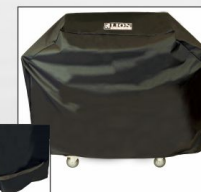
L90000 CANVAS CART COVER - CC506723 -