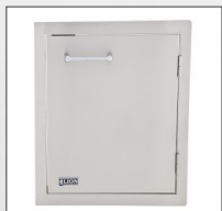
VERTICAL DOOR - L62945 -