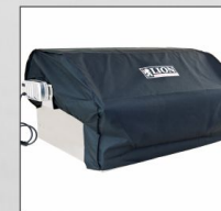
L90000 BUILT-IN CANVAS COVER - 62711 -