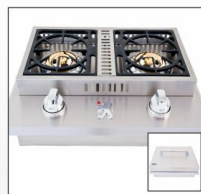
DOUBLE SIDE BURNER - LP1707 L1634 NG1634 -