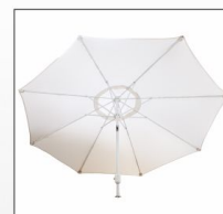
UMBRELLA - L1647 -