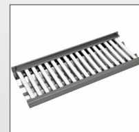
HEAT TUBES - L89746 -