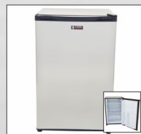
4.5 CU. FT REFRIGERATOR - L1001 -