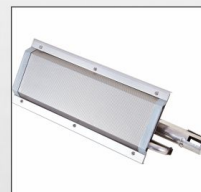
SEARING BURNER - 53218 -