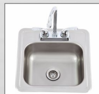
BAR FAUCET & SINK - 54167 -