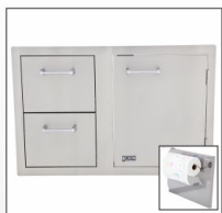
DOOR / DRAWER COMBO W/ TOWEL RACK - L3320 -