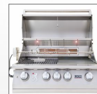
ROTISSERIE W/ HEAVY DUTY GEAR ACTION MOTOR - L75007 -