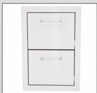
DOUBLE DRAWER - L2374 -